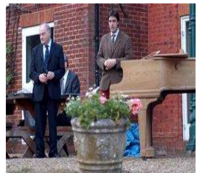
A concert from last term